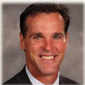
NHL New York Rangers Coach David Quinn