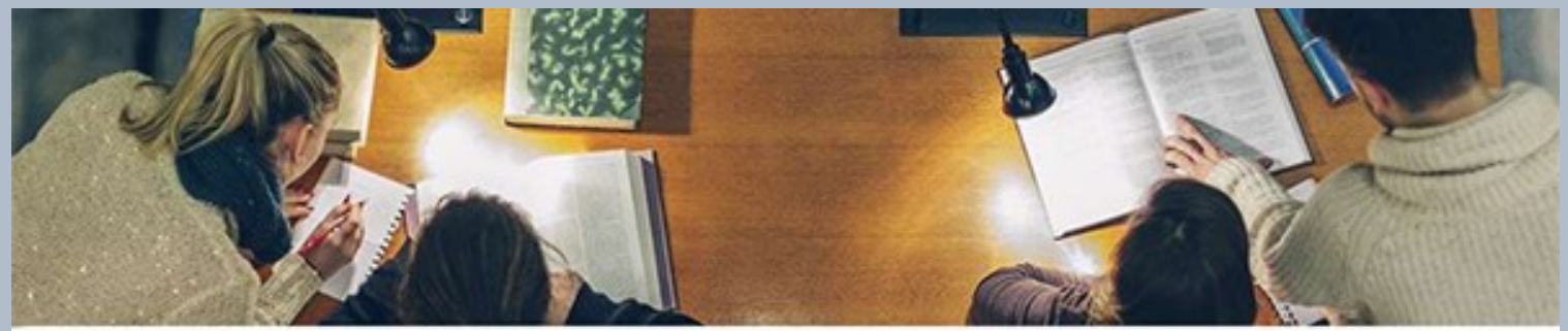
PGA Financial Assistance Fund Scholarship Program