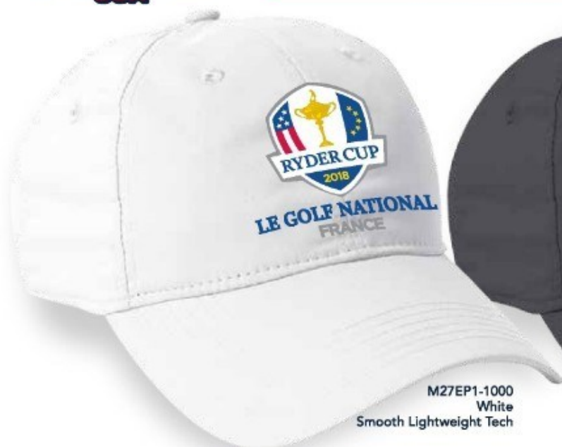
M27EP1-1000 White Smooth Lightweight Tech