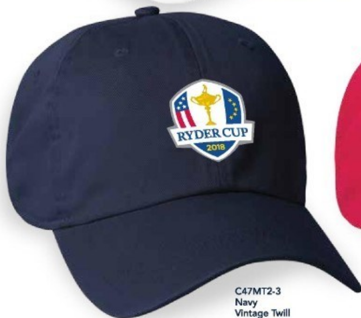
C47MT2-3 Navy Vintage Twill