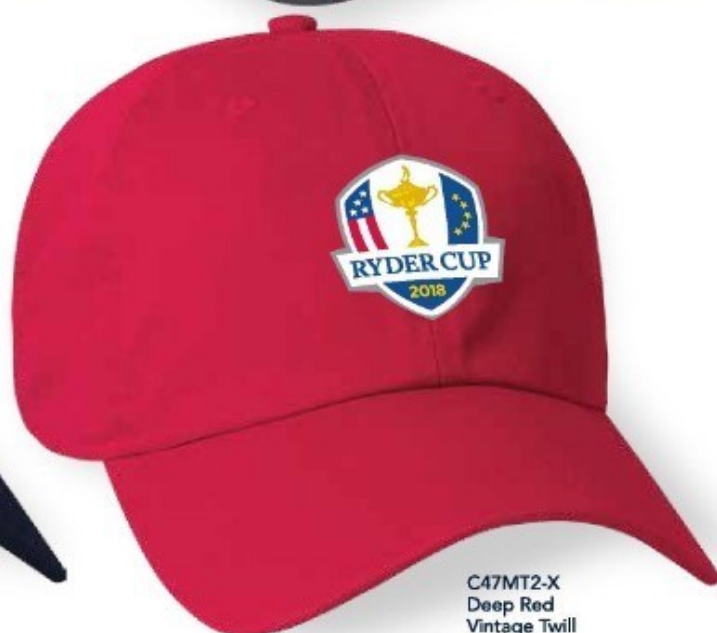
C47MT2-X Deep Red Vintage Twill