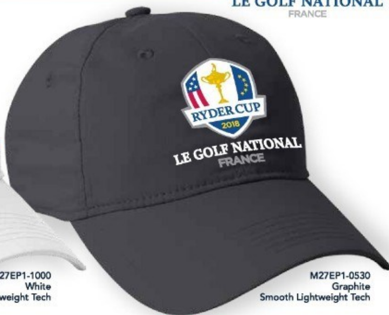
M27EP1-0530 Graphite Smooth Lightweight Tech